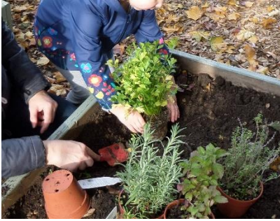
Planting herbs in the garden

November and December are a very busy time of year at Nursery with lots of events and things to celebrate with the children. We have been focusing on autumn and the changing seasons around us. As we enter November we will be celebrating Bonfire Night, Remembrance Day and Diwali, as well as looking forward to Christmas. We hope that the children enjoying learning and taking part in lots of crafts and creative activities related to these.