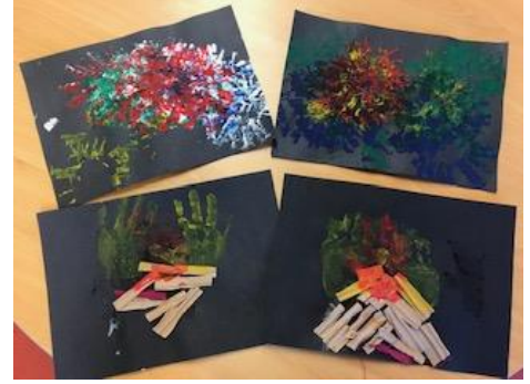
Our firework and bonfire artwork